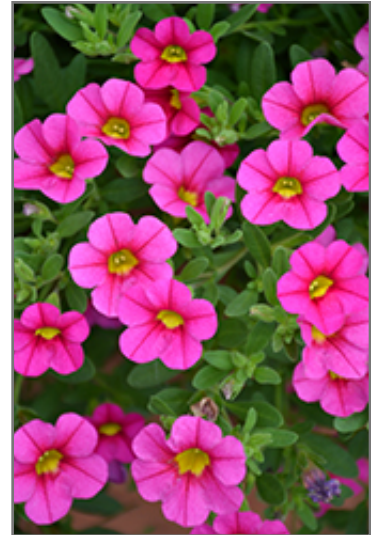
Catwalk Lipstick Pink Calibrachoa flowers

Catwalk Lipstick Pink Calibrachoa is recommended for the following landscape applications;