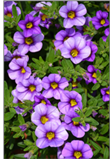
Kimono Blue Dragon Calibrachoa flowers

Kimono Blue Dragon Calibrachoa is recommended for the following landscape applications;