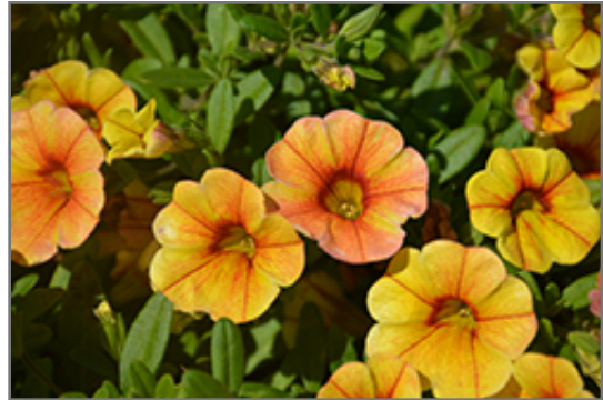
Kimono Tokyo Sunset Calibrachoa flowers