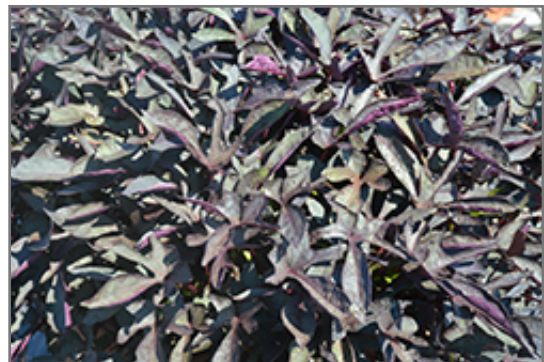
South of the Border Black Beans Sweet Potato Vine foliage