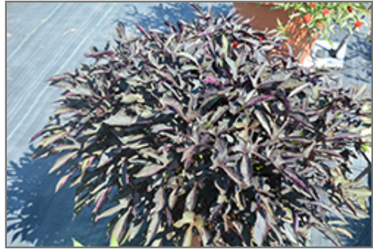
South of the Border Black Beans Sweet Potato Vine

South of the Border Black Beans Sweet Potato Vine will grow to be about 8 inches tall at maturity, with a spread of 3 feet. When grown in masses or used as a bedding plant, individual plants should be spaced approximately 12 inches apart. Its foliage tends to remain low and dense right to the ground. This fast-growing annual will normally live for one full growing season, needing replacement the following year.