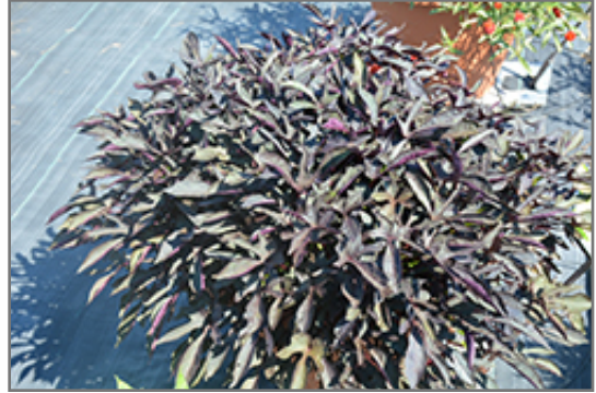
South of the Border Black Beans Sweet Potato Vine

When grown indoors, South of the Border Black Beans Sweet Potato Vine can be expected to grow to be about 8 inches tall at maturity, with a spread of 3 feet. It grows at a fast rate, and under ideal conditions can be expected to live for approximately 1 years. This houseplant will do well in a location that gets either direct or indirect sunlight, although it will usually require a more brightly-lit environment than what artificial indoor lighting alone can provide. It does best in average to evenly moist soil, but will not tolerate standing water. The surface of the soil shouldn't be allowed to dry out completely, and so you should expect to water this plant once and possibly even twice each week. Be aware that your particular watering schedule may vary depending on its location in the room, the pot size, plant size and other conditions; if in doubt, ask one of our experts in the store for advice. It is not particular as to soil pH, but grows best in rich soil. Contact the store for specific recommendations on pre-mixed potting soil for this plant.