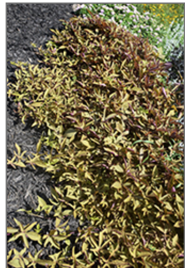
South of the Border Refried Beans Sweet Potato Vine