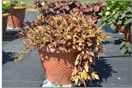
South of the Border Refried Beans Sweet Potato Vine

South of the Border Refried Beans Sweet Potato Vine will grow to be about 8 inches tall at maturity, with a spread of 3 feet. When grown in masses or used as a bedding plant, individual plants should be spaced approximately 12 inches apart. Its foliage tends to remain low and dense right to the ground. This fast-growing annual will normally live for one full growing season, needing replacement the following year.