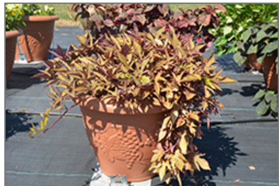
South of the Border Refried Beans Sweet Potato Vine