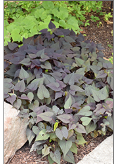
Sweet Georgia Heart Purple Sweet Potato Vine