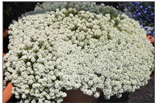
Snow Globe Alyssum in bloom