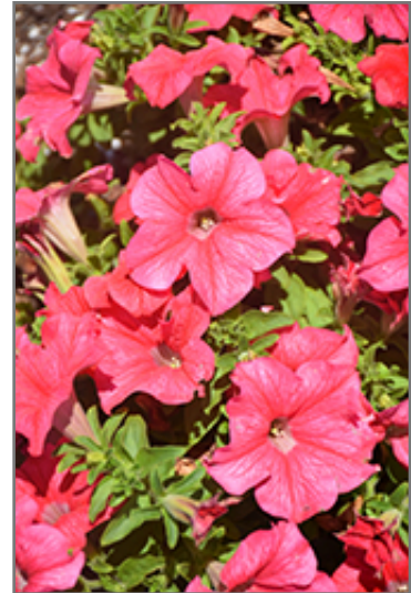
Panache Coral Reef Petunia flowers

Panache Coral Reef Petunia is a fine choice for the garden, but it is also a good selection for planting in outdoor containers and hanging baskets. It is often used as a 'filler' in the 'spiller-thriller-filler' container combination, providing a mass of flowers against which the thriller plants stand out. Note that when growing plants in outdoor containers and baskets, they may require more frequent waterings than they would in the yard or garden.