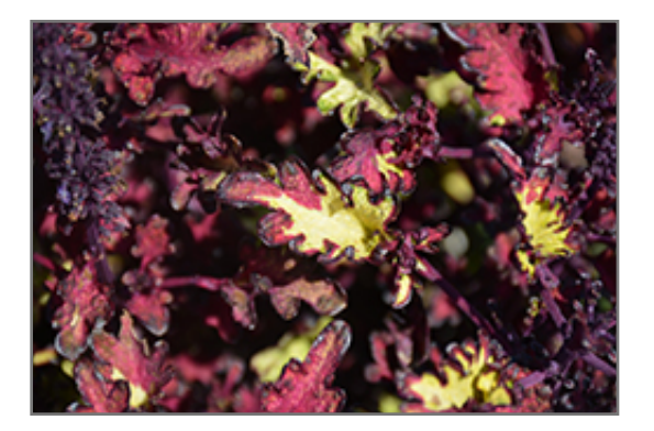
Under the Sea Sea Monkey Rust Coleus foliage