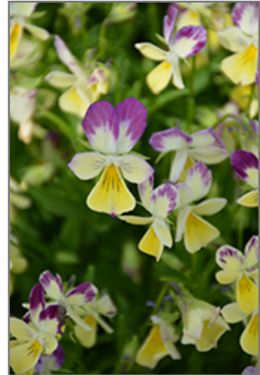
Hip Hop Honeybunny Pansy flowers

Hip Hop Honeybunny Pansy is recommended for the following landscape applications;