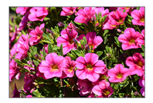
Aloha Cranberry Calibrachoa flowers

17999 WCR 4 Brighton, CO, 80603 phone: 303-775-9629 www.incolorme.com