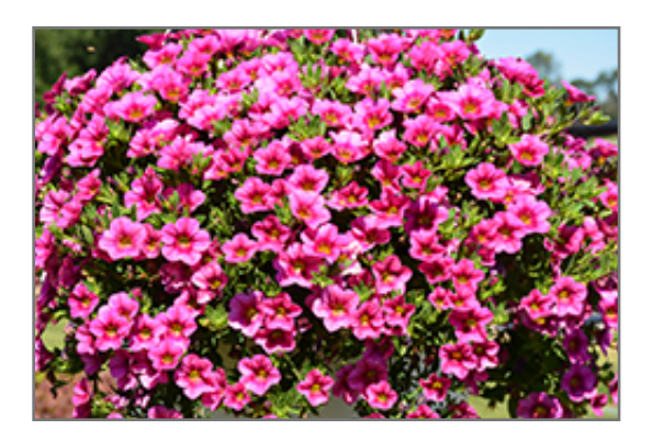
Aloha Cranberry Calibrachoa flowers Photo courtesy of NetPS Plant Finder