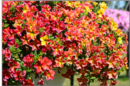
Aloha Nani Red Cartwheel Calibrachoa flowers