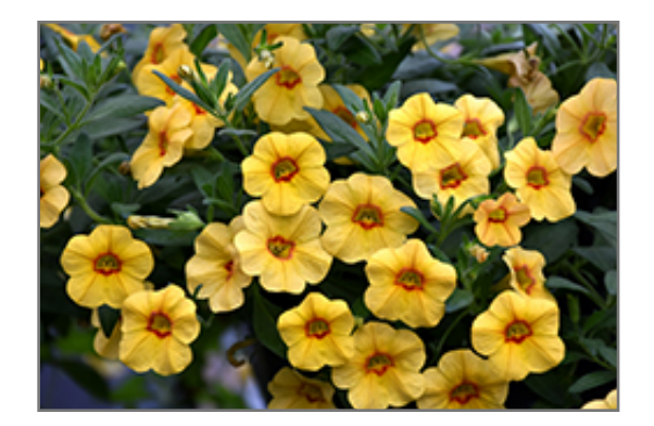
Callie Gold with Red Eye Calibrachoa flowers