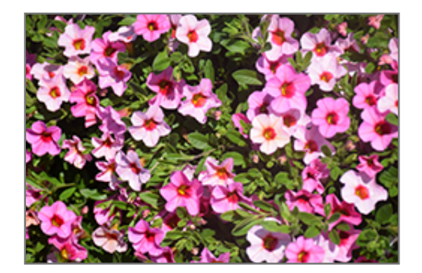
Kabloom Light Pink Blast Calibrachoa flowers