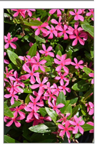
Soiree Kawaii Pink Vinca flowers