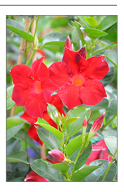
Sun Parasol Dark Red Mandevilla flowers

There are many factors that will affect the ultimate height, spread and overall performance of a plant when grown indoors; among them, the size of the pot it's growing in, the amount of light it receives, watering frequency, the pruning regimen and repotting schedule. Use the information described here as a guideline only; individual performance can and will vary. Please contact the store to speak with one of our experts if you are interested in further details concerning recommendations on pot size, watering, pruning, repotting, etc.