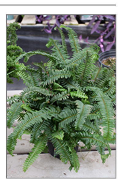
Kimberley Queen Australian Sword Fern in full

There are many factors that will affect the ultimate height, spread and overall performance of a plant when grown indoors; among them, the size of the pot it's growing in, the amount of light it receives, watering frequency, the pruning regimen and repotting schedule. Use the information described here as a quideline only; individual performance can and will vary. Please contact the store to speak with one of our experts if you are interested in further details concerning recommendations on pot size, watering, pruning, repotting, etc.