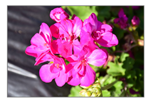
Calliope Medium Deep Rose Geranium flowers