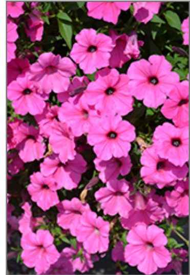
ColorRush Pink Petunia flowers