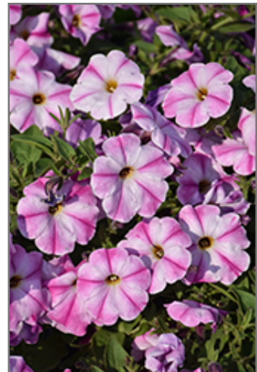
ColorRush Pink Star Petunia flowers