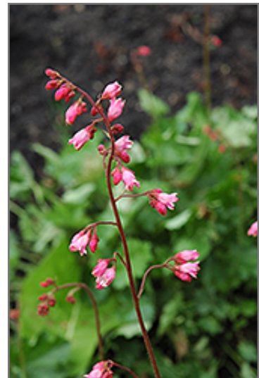
Brandon Pink Coral Bells flowers