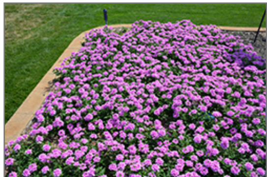
EnduraScape Pink Bicolor Verbena in bloom