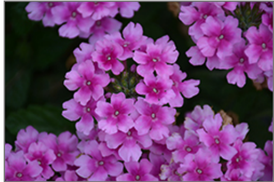
EnduraScape Pink Bicolor Verbena flowers

EnduraScape Pink Bicolor Verbena is recommended for the following landscape applications;