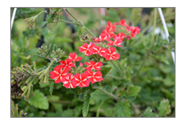
Lanai Synchro Red Star Verbena flowers

17999 WCR 4 Brighton, CO, 80603 phone: 303-775-9629 www.incolorme.com