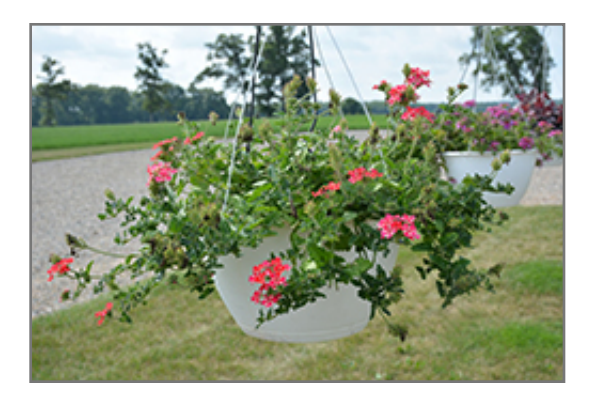
Lanai Synchro Red Star Verbena in bloom