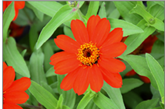
Zahara XL Fire Zinnia flowers