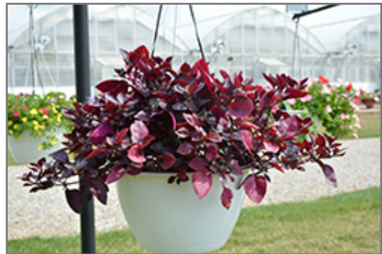
Brazilian Joy Weed