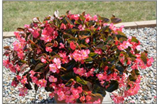
Megawatt Pink Bronze Leaf Begonia in bloom

Megawatt Pink Bronze Leaf Begonia is a fine choice for the garden, but it is also a good selection for planting in outdoor containers and hanging baskets. With its upright habit of growth, it is best suited for use as a 'thriller' in the 'spiller-thriller-filler' container combination; plant it near the center of the pot, surrounded by smaller plants and those that spill over the edges. It is even sizeable enough that it can be grown alone in a suitable container. Note that when growing plants in outdoor containers and baskets, they may require more frequent waterings than they would in the yard or garden.