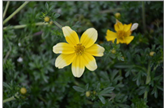
Cupcake Banana Cream Bidens flowers