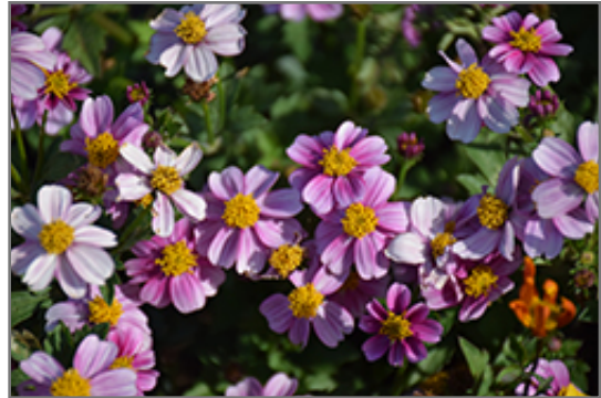
Pretty in Pink Bidens flowers