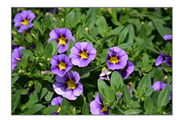
StarShine Blue Calibrachoa flowers