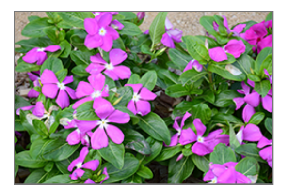
Mega Bloom Deep Lavender Vinca flowers