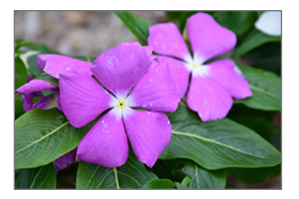
Mega Bloom Deep Lavender Vinca flowers

17999 WCR 4 Brighton, CO, 80603 phone: 303-775-9629 www.incolorme.com