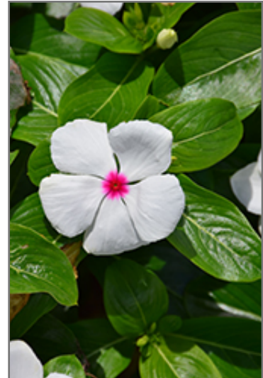
Mega Bloom Polka Dot Vinca flowers