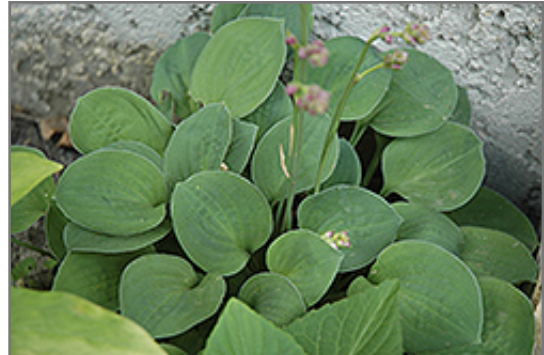
Baby Bunting Hosta foliage

Baby Bunting Hosta is recommended for the following landscape applications;