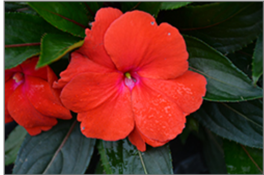
Magnum Red Flame New Guinea Impatiens flowers