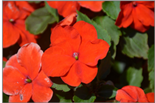
Accent Premium Deep Orange Impatiens flowers