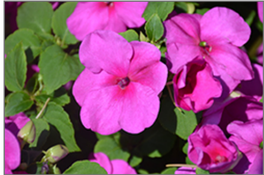
Accent Premium Lilac Impatiens flowers