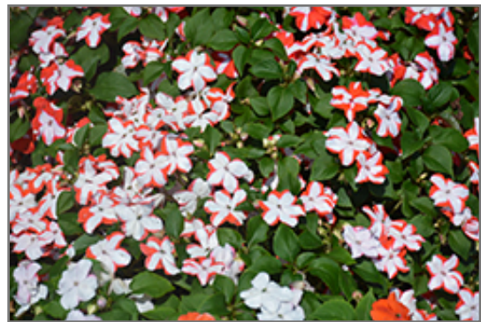
Accent Premium Orange Star Impatiens flowers