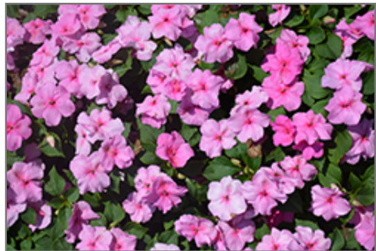
Accent Premium Pink Impatiens flowers