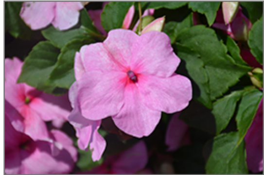
Accent Premium Pink Impatiens flowers