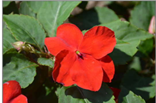
Accent Premium Red Impatiens flowers