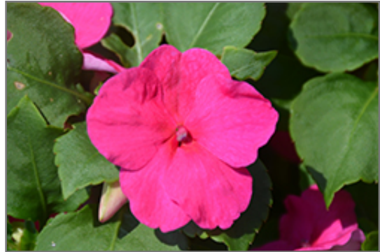
Accent Premium Rose Impatiens flowers