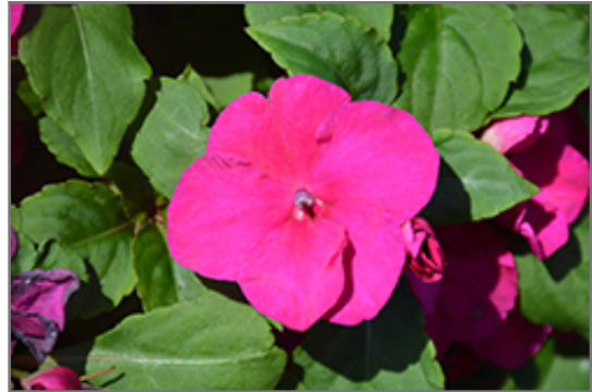
Accent Premium Violet Impatiens flowers