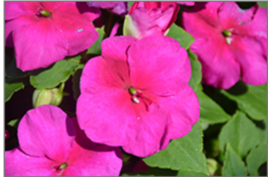
Super Elfin Ruby Impatiens in bloom