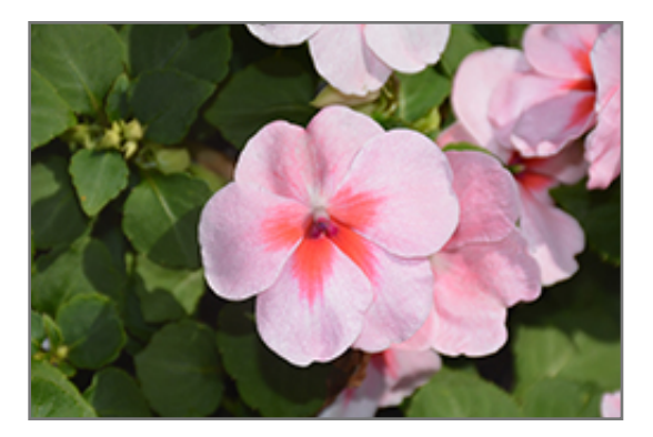
Super Elfin XP Coral Impatiens in bloom

Super Elfin XP Coral Impatiens is a dense herbaceous annual with a mounded form. Its medium texture blends into the garden, but can always be balanced by a couple of finer or coarser plants for an effective composition.