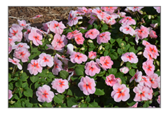
Super Elfin XP Coral Impatiens flowers

This plant will require occasional maintenance and upkeep, and should not require much pruning, except when necessary, such as to remove dieback. It has no significant negative characteristics.