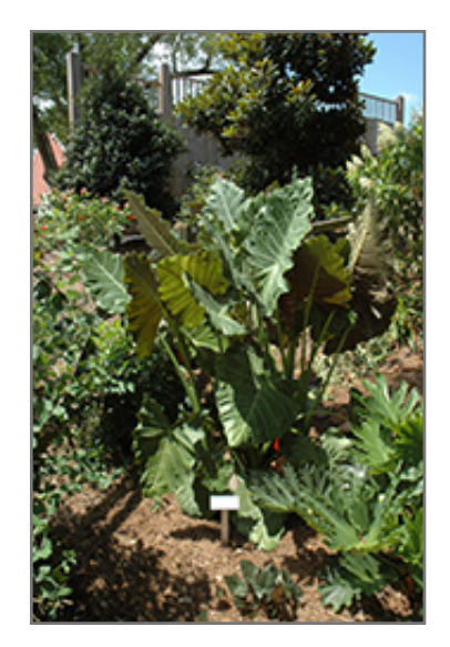
Yucatan Princess Elephant's Ear