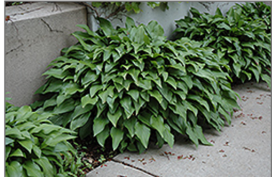
Invincible Hosta