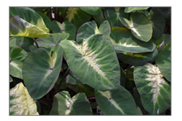
Royal Hawaiian Tropical Storm Elephant Ear foliage