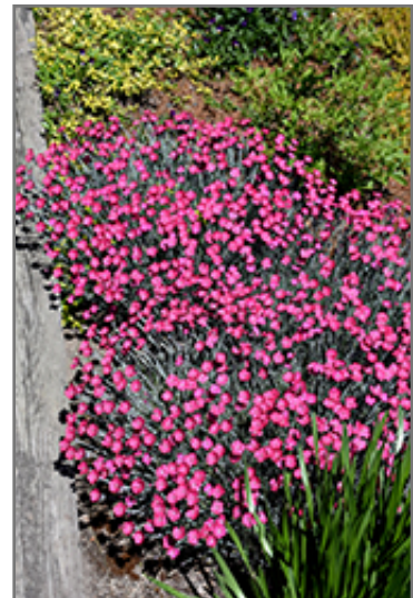
Wicked Witch Pinks in bloom