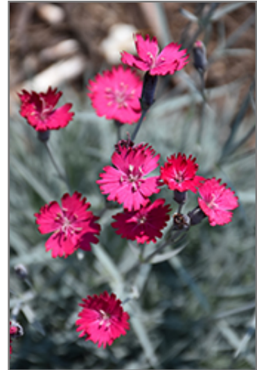
Wicked Witch Pinks flowers