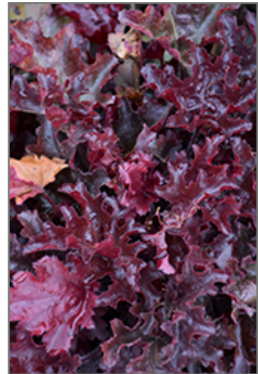
Dolce Cherry Truffles Coral Bells foliage