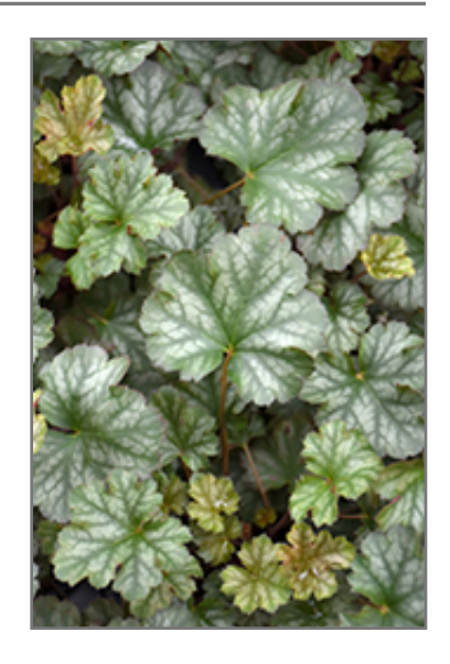
Harvest Burgundy Coral Bells foliage